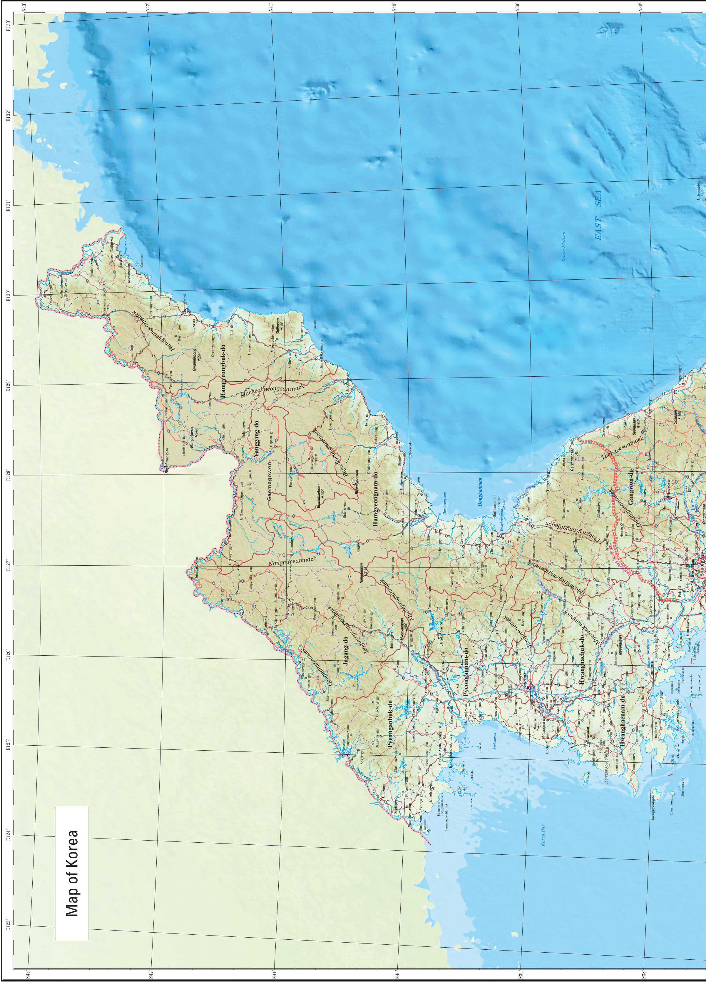
Map of Korea